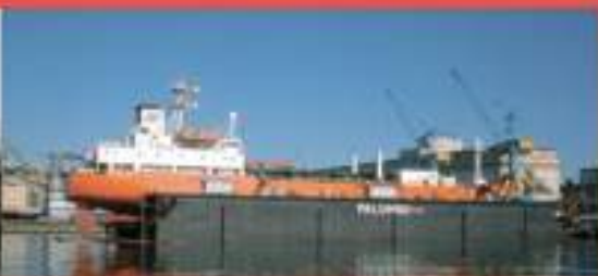
Bacino galleggiante Palumbo 6.000 ton - largh. 25 mt NAPOLI