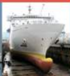
Bacino in muratura lung. 267 mt - largh. 38 mt MESSINA